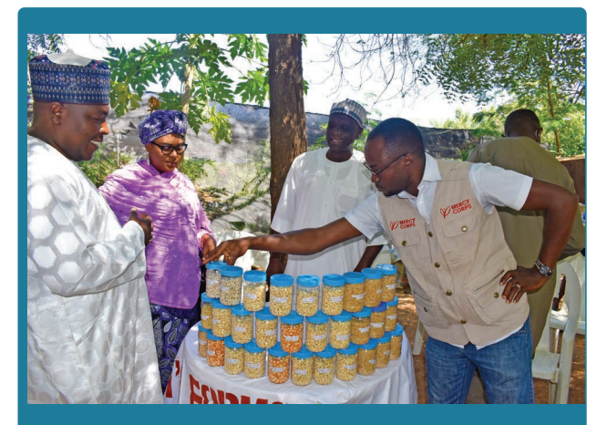
Seed varieties grown by seed entrepreneurs at Asmau Farms in Yola, Adamawa State

The "Access to Agro-inputs" intervention in the Rural Resilience Activity is implemented in collaboration with private sector partners. The Activity has formed good working relationships and partnerships with 14 private sector partners, who are supporting participants - smallholder farmers - to improve information and knowledge around GAPs. For instance, through the partnership with Interra Networks, the NIGSIMS platform onboarded a total of 20 seed companies, 100 seed traders, and 7,130 farmers. Through the partnership with Golden Agric Input Limited, a total of NGN42,000,000 sales of hybrid pioneer maize seeds were sold. The Activity is in partnership with M and A Greenery, Golden Agric Input Limited, Notore Chemical Industries, Asma'u Seeds, Albit and Agro Consult, Alkay Seeds, Jirkur Seeds, Viable Seeds, Lake Chad Research Institute Seed Company, Meleri Seeds, Nagarta Seeds, Green Pal Global Ventures Seeds, Sa'a Seeds, Sadiq and Nana Seeds, and Interra Networks to improve access to agricultural inputs in the Northeast.