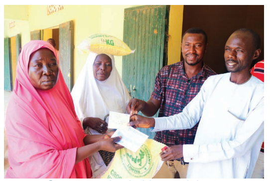
Smart seed subsidy receipients

"I bought a bag of maize seeds and herbicides, and I would love that the input fair would be organized every month because the prices of what I paid here are less than what I would usually get in the market."