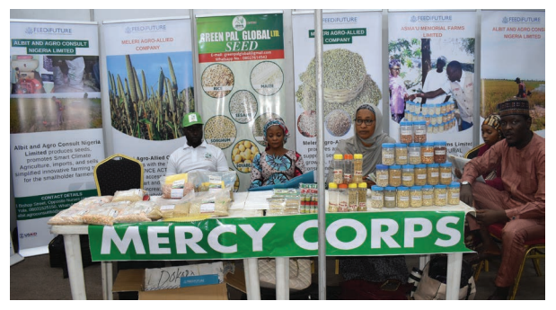
Rural Resilience Activity's private sector partner showcasing products at the SeedConnect event

Because farmers' purchasing power differs, the Activity encourages seed companies like GreenPal Ventures in Gombe State to create smaller packages (2kg) of seeds that are more affordable to smallholder farmers and can increase access to improved seeds for producers who are cultivating smaller pieces of land.