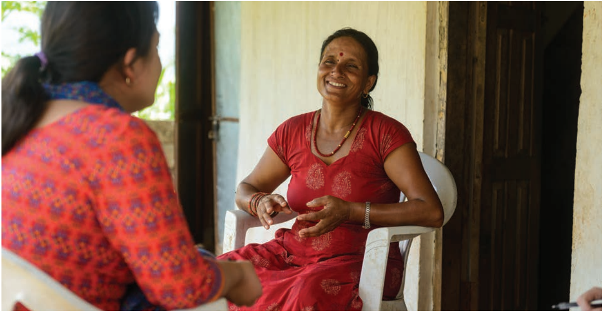
Women chat in Makwanpur, Nepal. Miguel Samper/Mercy Corps, 2014.