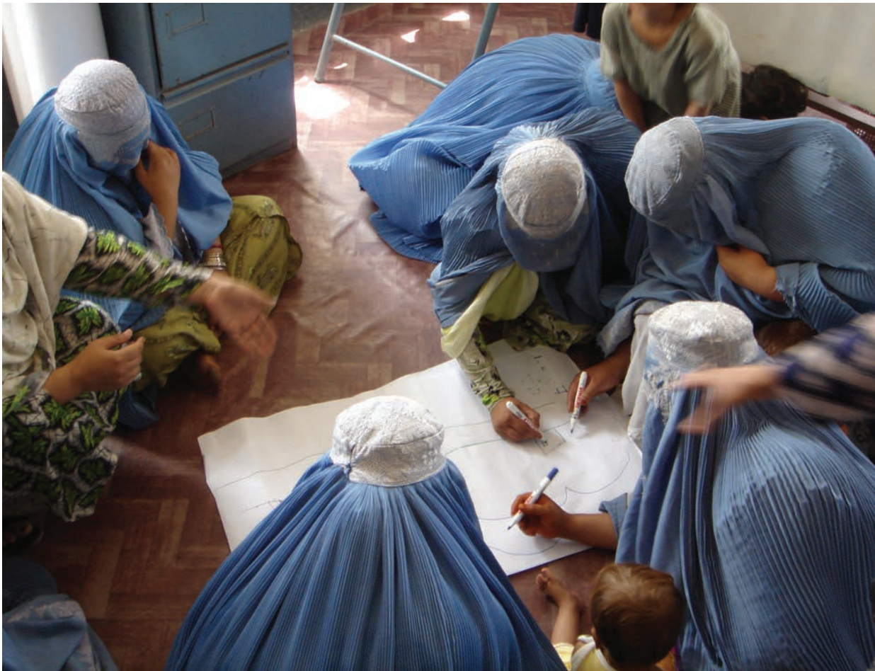
Women participate in a workshop in Jalalabad, Afghanistan. Colin Spurway/Mercy Corps, 2006.