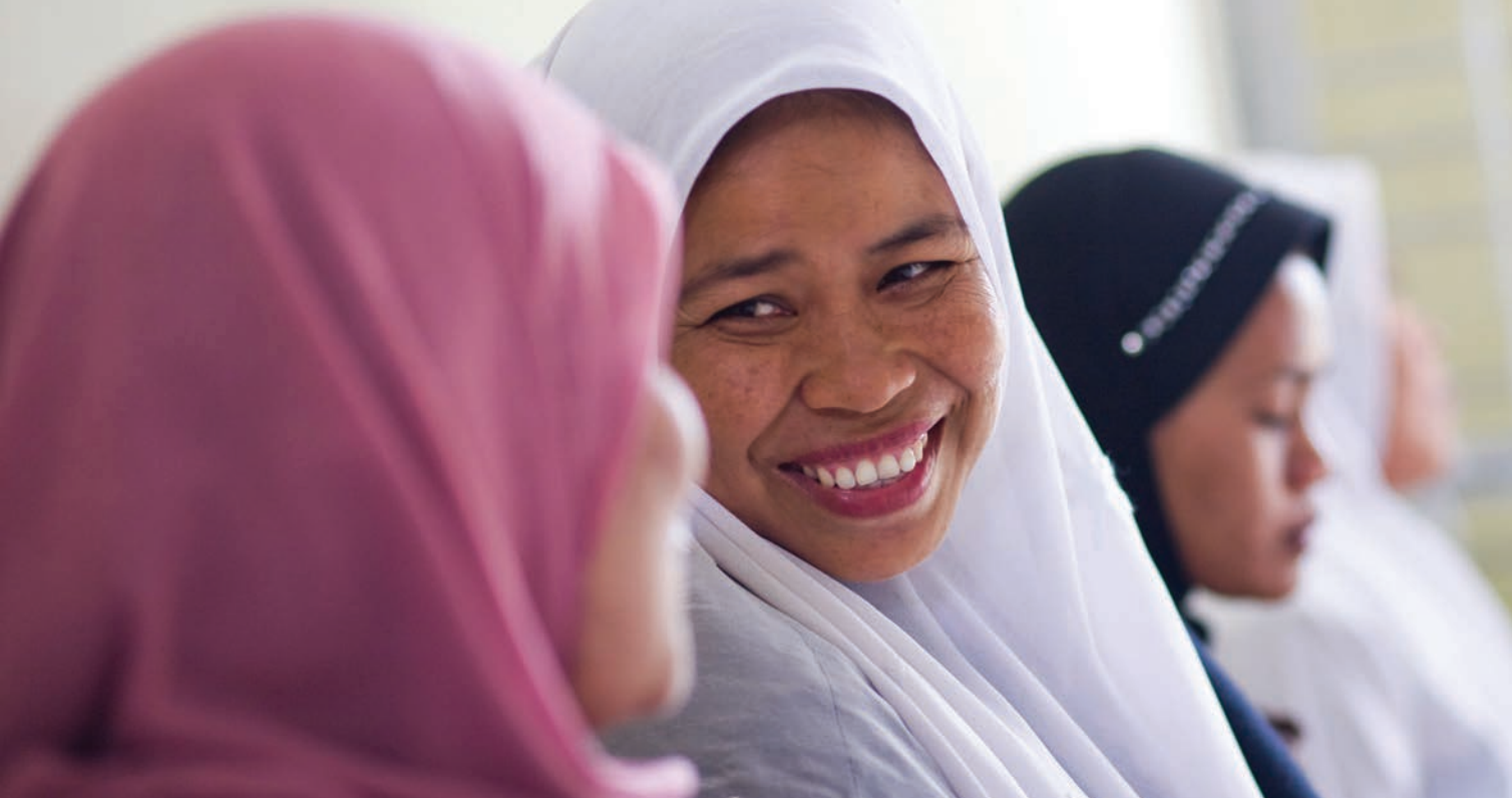
Women gather in Aceh Province, Indonesia.

This report by the Resilience, Evaluation, Analysis and Learning (REAL) Associate Award—jointly written by The Share Trust and Mercy Corps—synthesizes the state of knowledge on the linkages between psychosocial factors and resilience through the lens of Self Help Groups. The objective of the report is two-fold. First, it seeks to provide practitioners and researchers with a better understanding of what is already known about how psychosocial factors contribute to resilience through Self Help Groups. Second, in synthesizing the state of knowledge on this topic, it highlights the gaps in the current evidence base to inform a learning agenda.