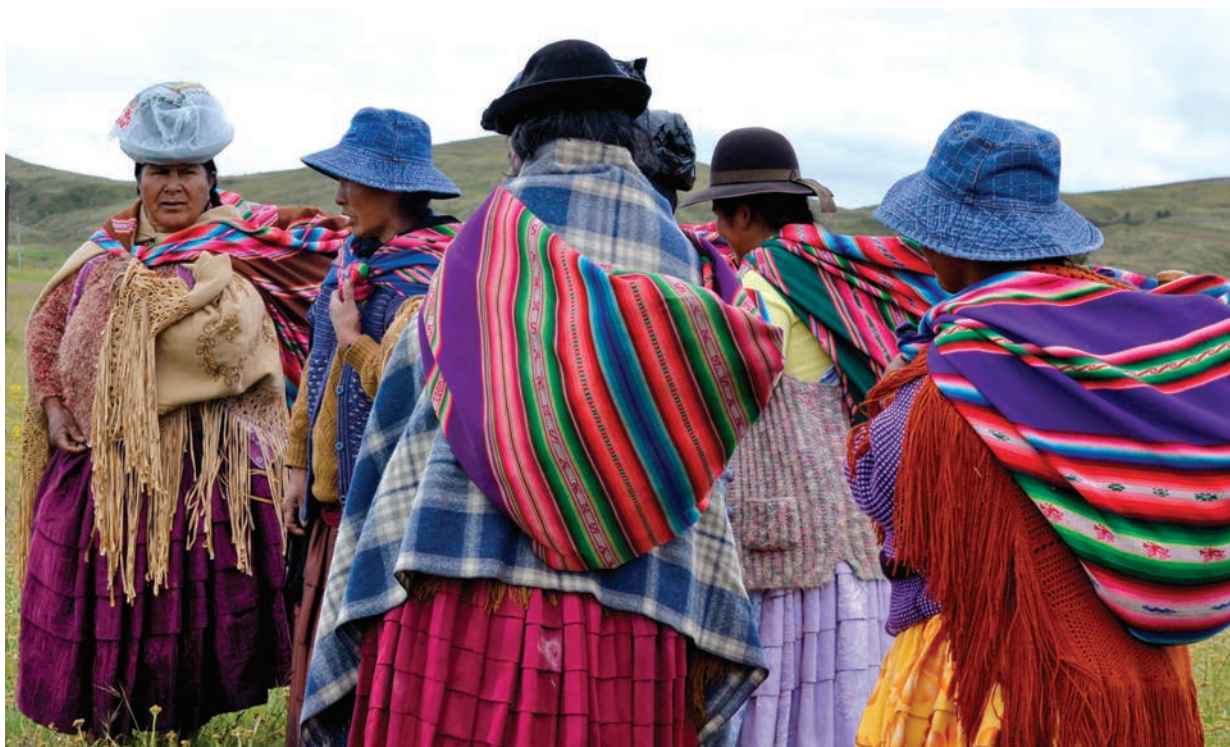
Women gather as part of a land mapping celebration in Bolivia.

While a great deal of investment has gone into building resilience to disaster and conflict across countries and contexts, the literature highlights that work to-date has fundamentally focused on the more tangible or objective elements of resilience, such as material assets, livelihoods strategies, and access to finance. A limited understanding of the key role that subjective elements, and in particular psychosocial factors, can play in resilience investments is a notable gap, particularly in contexts affected by fragility and conflict. The evidence that does exist strongly indicates that psychosocial factors such as social capital and women's empowerment are important sources of resilience. The relevance of these psychosocial factors transcends context; they play a role in resilience globally, across a range of both natural disasters and fragile and conflict-affected settings. As highlighted by the growing body of evidence, Self Help Groups offer a promising opportunity to stimulate and strengthen both subjective and objective resilience capacities amongst their members, households, and communities.